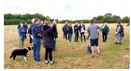
A FOWM walk to see and hear about the archaeology of Worts Meadow, led by members of the CCC archaeology team.

Worts Meadow led by two members of the Cambridge County Council archaeology team. Around 30 people enjoyed seeing and hearing about the archaeology and history of Worts Meadow, followed by a short walk to the Tithe Barn for refreshments kindly provided by the Tithe Barn Trust and a short presentation on the barn's history.