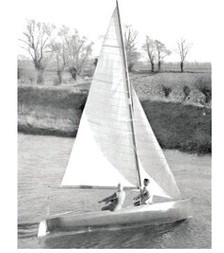
Dinghies Approaching the Buoy at Bottisham Lock

Grounds and Facilities - It was quickly realised after the war that the club was lacking in any modern